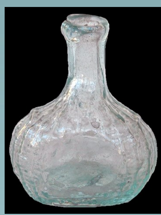
Complete example of a similar cologne bottle from a private collection.