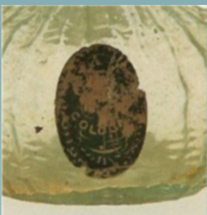
Paper label from a similar bottle from a private collection.