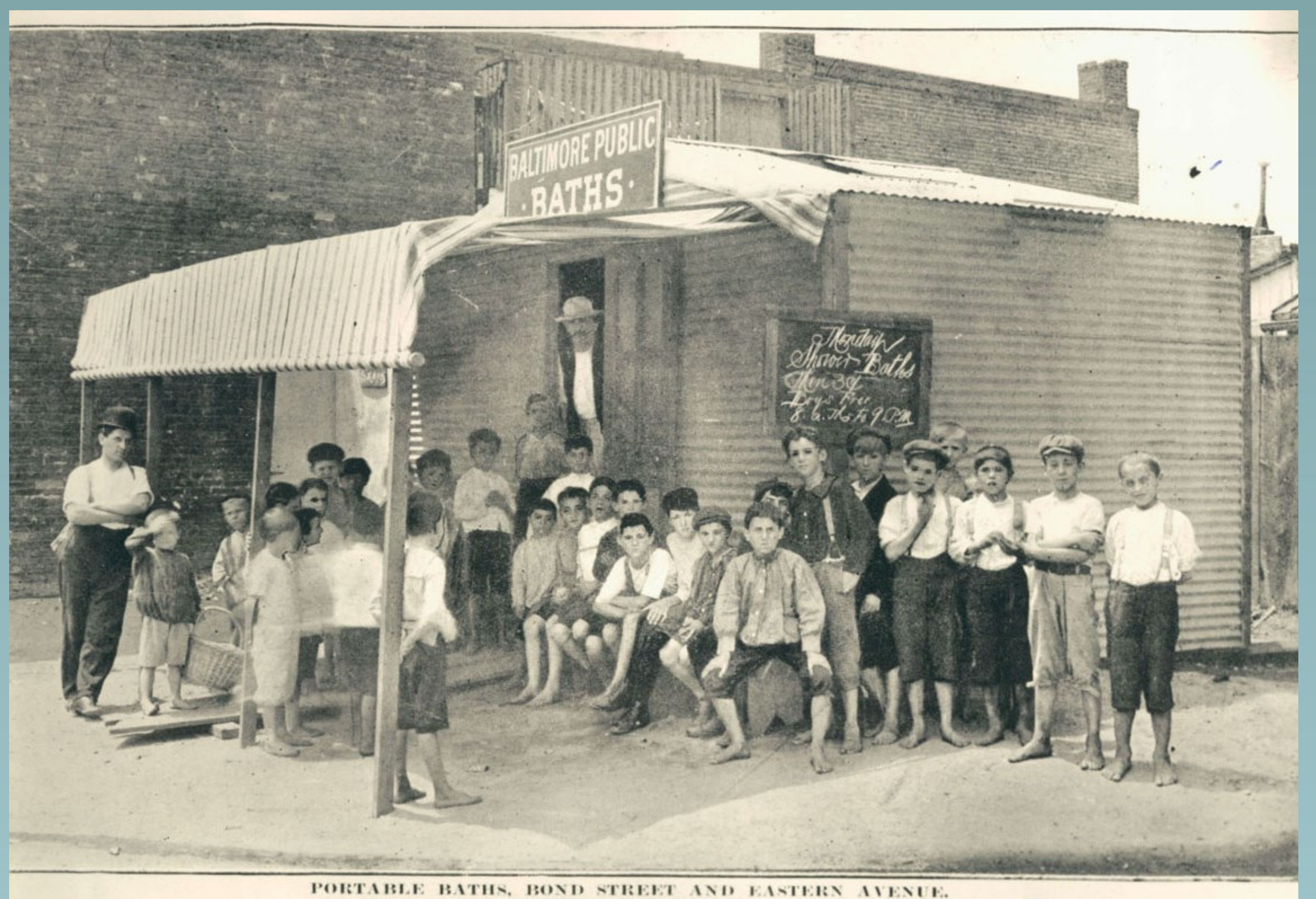
Public baths were often the only option for Baltimore's unwashed population.