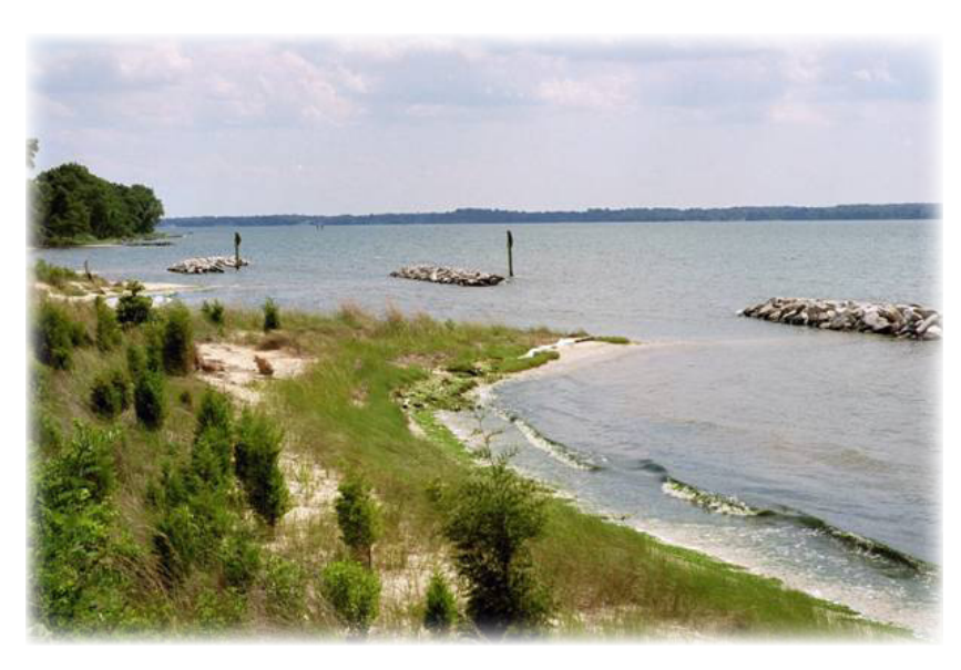
Kings Reach breakwaters.