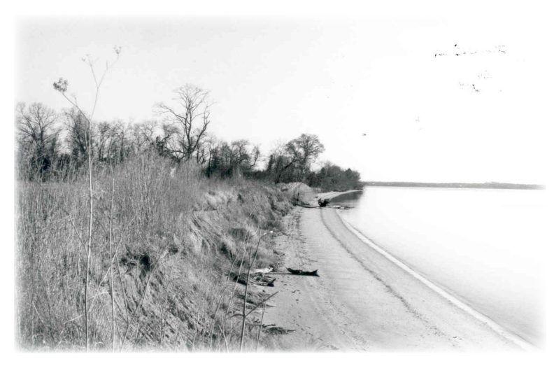
Pre-construction shoreline at Kings Reach.

It is easy to notice that the sand bars (tombolos) that join the shoreline to each breakwater vary from strongly connected to just barely attached - at low tide. Exposure to greater wave energy has eroded the material behind one breakwater in particular, yet the beach remains stable. When first constructed, these bars were all similarly joined with a substantial amount of fill material. Observe how the