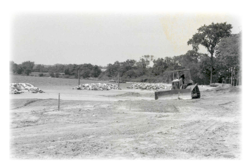
Kings Reach breakwaters during construction.

plant communities behind the breakwaters are different. The shoreline behind the marginally connected breakwater supports less vegetation and looks more like a beach. In contrast, behind the northernmost breakwater, the tombolo is high in elevation and completely intact. Notice how the northern tombolo