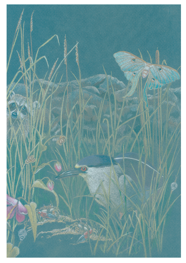
Wildlife that might be found at night along JPPM fringe marshes: luna moth, racoon, red-jointed fiddler crabs, and marsh periwinkle snails.

The marsh behind the sill was created by planting different Spartina species adapted to regularly and irregularly flooded tidal zones. Smooth cordgrass ( Spartina alterniflora ) was planted from mid-tide to spring high tide elevation. Saltmeadow hay ( Spartina patens ) was planted from mean high water and above to the high water line of storm tides. A short distance away from the embankment are some groundsel tree shrubs ( Baccharis halimifolia ). Groundsel tree is often confused with high-tide bush ( Iva frutescens ), another common wetland shrub. Groundsel tree supports marsh wrens and other small birds that frequently nest there. Scientists are currently assessing groundsel tree for its potential value in stabilizing tidal shorelines because of its ability to root from a dormant, unrooted cutting. Although it grows naturally in the upper fringes of irregularly flooded tidal fresh and brackish marshes, it may become weedy or invasive in some habitats and its leaves are poisonous to livestock.