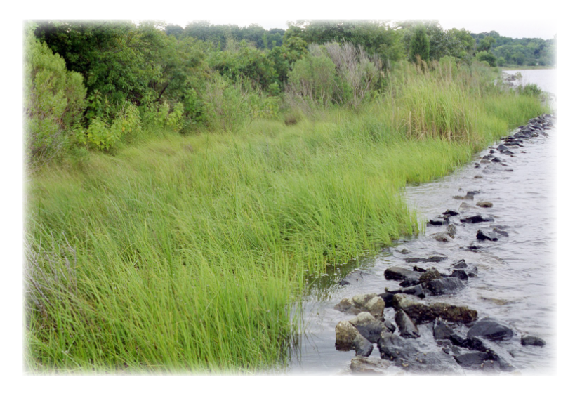
A low sill parallel to the shore allows marsh vegetation to prosper.

A sill is usually placed at mean low water to retain sand fill material which is then graded and planted with marsh grass. Sills are normally designed with a top elevation between 6-12 inches above mean high water. However, a sill can be designed with a higher elevation (1-2feet above mean high water) to increase shore protection, or with a lower elevation to "overtop" with the daily high tide.