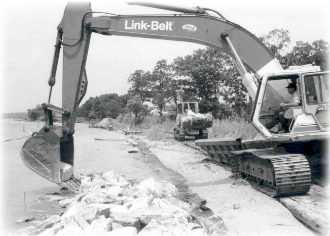
Sill structure during construction.

The sills here are continuous with no openings. Further south on JPPM, sills were designed with gaps or open segments. The gaps help maintain normal water temperatures behind the sill and allow access to quiescent pools of water, wetlands and edge habitats by larger animals like otters, bait fish and terrapins. To protect shoreline features behind the gaps, the sills curve outward, are higher in elevation and overlap slightly at adjoining sections. Heavier stone weights are specified by