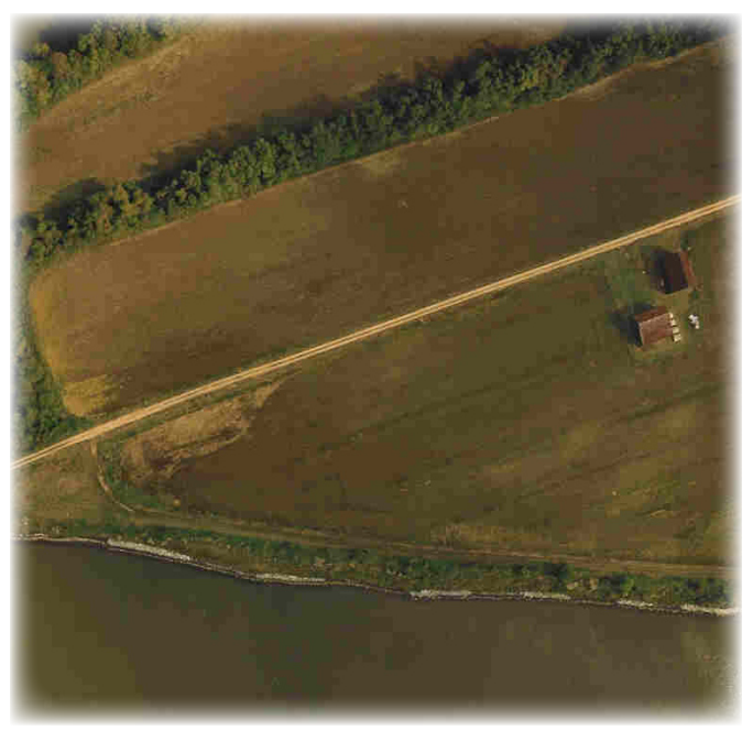
Variable height sills found along Site 4 shoreline.