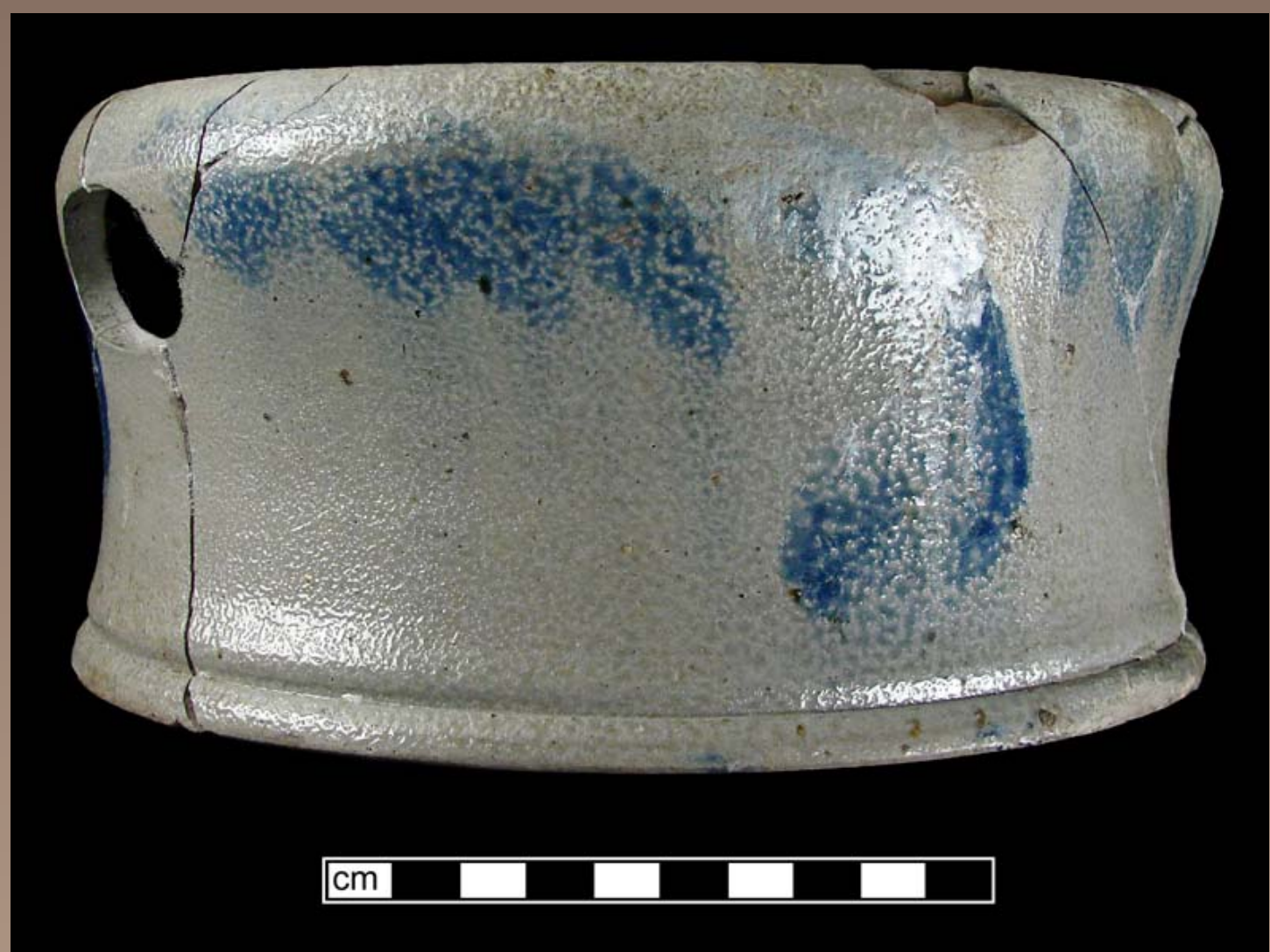
Side view of the mended spittoon found in a privy at the Federal Reserve Bank Site.

he spittoon found in the privy was 4¾" tall, 10" in diameter and made with a gray salt glazed clay body. The clay body would first be fired to 1600 to 1800 degrees, and then have salt glaze applied. The designs were painted on before firing, using a cobalt mixture.