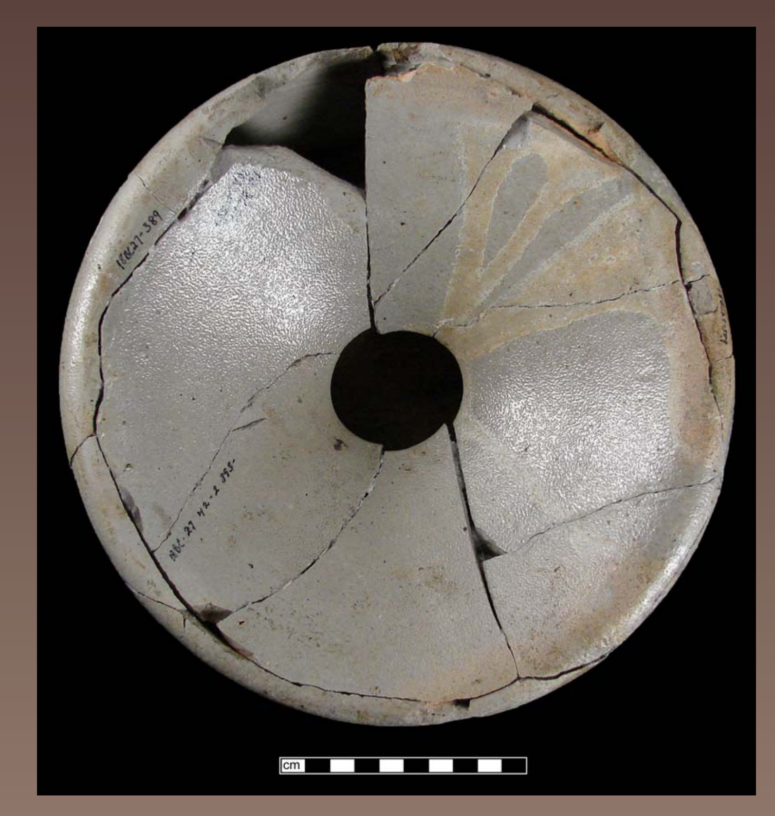
Top view of the mended spittoon found in a privy at the Federal Reserve Bank Site.

hewing tobacco was even more popular among baseball players. Players found that chewing increased saliva, helping to lubricate mouths that had become dry in the dusty diamond. And when the leather glove became popular in the 1870s and 1880s, the players also found that spitting could be used to soften the leather (1). Pitchers believed that spitting on baseballs before pitching would decrease the air drag, in turn improving their aerodynamics and speed. These notorious pitches were referred to, quite appropriately, as "spitballs" and were permitted up until 1920 (2).