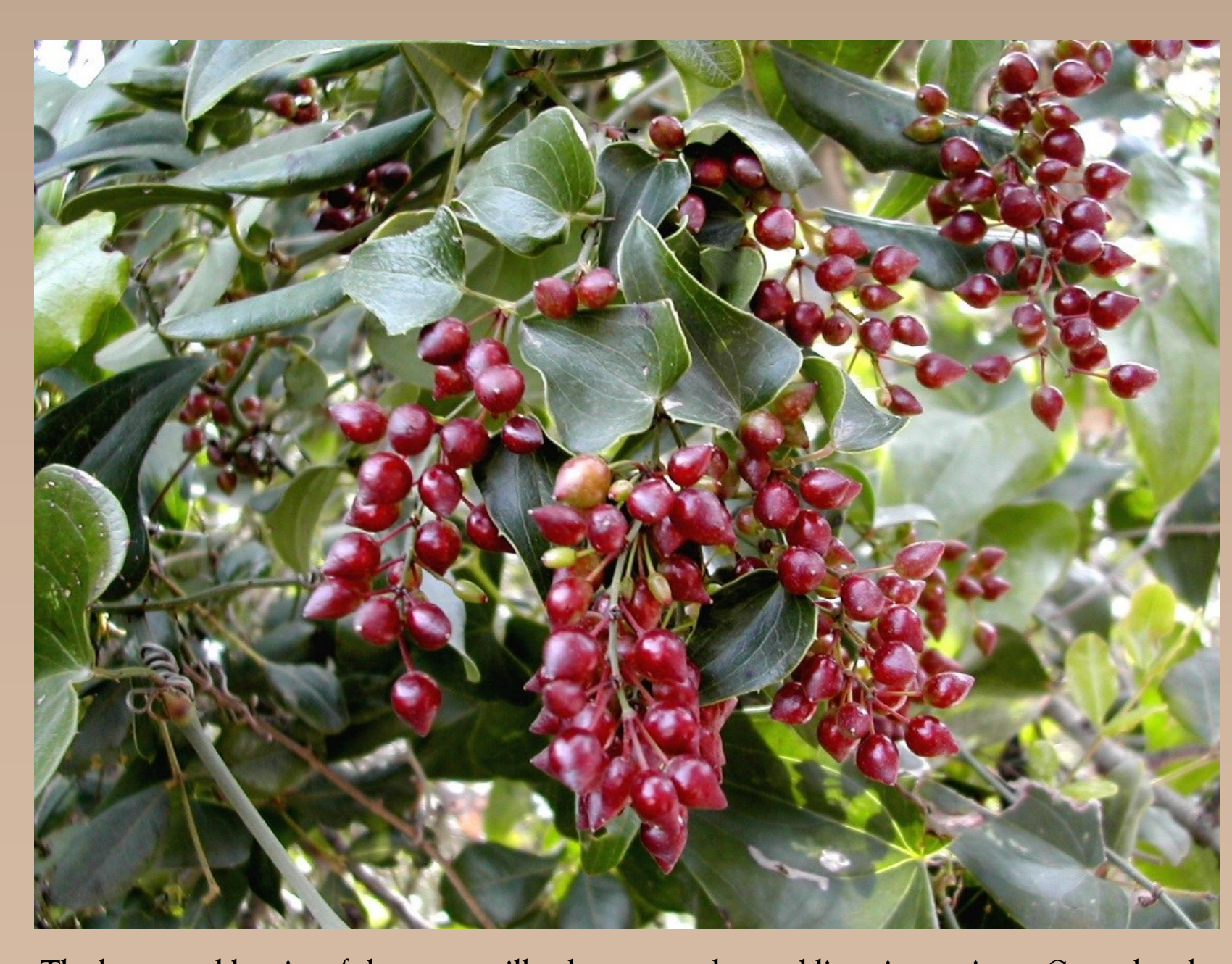
The leaves and berries of the sarsaparilla plant, a woody, rambling vine native to Central and South America. http://therootsstory.co.uk/sarsaparilla/