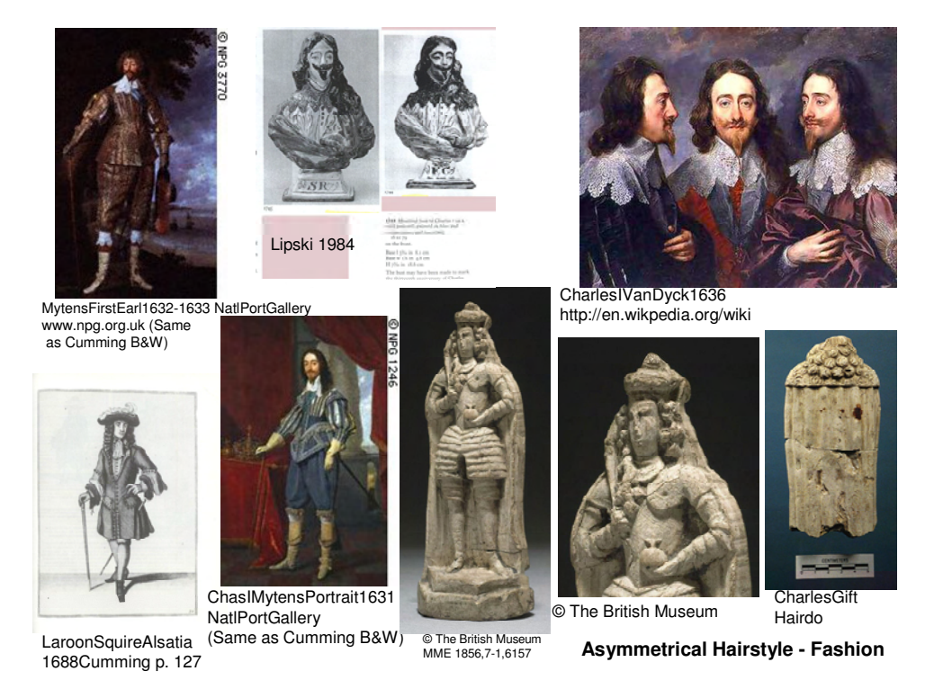
Fig. IV – A-symmetrical Hairstyle Images

Because the figurine at the British Museum is the sole surviving figurine with a head, a detailed comparison of its characteristics with the Charles Gift figurine as well as the other figurines in the study is warranted. Comparison of hairstyle and regalia reveals that seventeenth-century pipe clay figurine makers incorporated popular fads as well as subtle changes to established regal props in the molding of these mini-kings. There is not enough evidence to stipulate whether the variation occurred over time, or by geographic location, or if it occurred simultaneously for specific groups of consumers. The one surviving head on the British Museum figurine cannot serve as a model for all of the other kings' heads. It lacks the beard apparent on the Charles Gift figurine and the headdress is different.