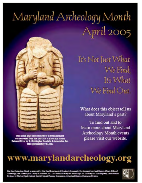
Fig. II: Maryland Archeology Month Poster (www.marylandarcheology.org)

This 300-year-old, mended, six-inch torso presently lies in state against a goldenyellow background in a display case at Historic St. Mary's City's archaeological museum in southern Maryland. Its label reads: "White clay statue fragment from Charles Gift, located aboard the Naval Air Station, Patuxent River, Maryland." Against a violet background on a poster for Maryland Archaeology Month 2005, this same headless figurine stands erect above the statement, "It's not just what we find; it's what we find out." (See Fig. II) In the cyber space of an EBay auction, a similar smaller monarch figurine sold for $214. What is so compelling about a miniature headless royal 300 years after its original use?