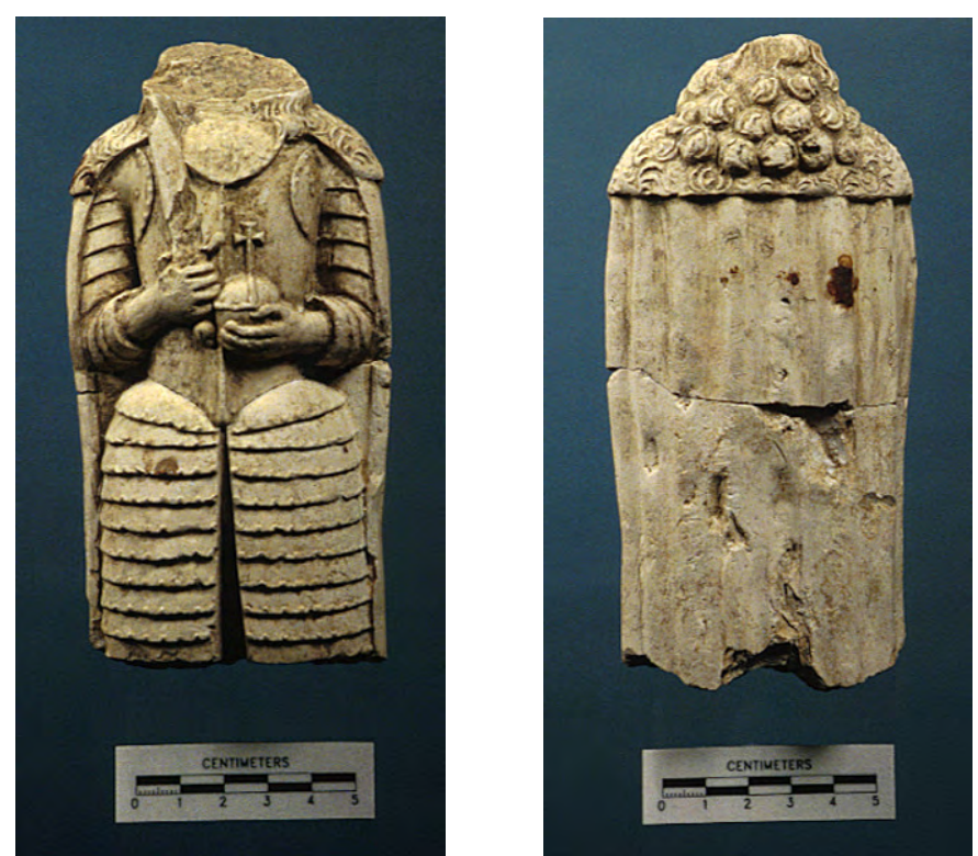
Fig. I: Figurine from Charles Gift Site (18ST704), St. Mary's County, Maryland (See also Exhibit 1 for a detailed description.)